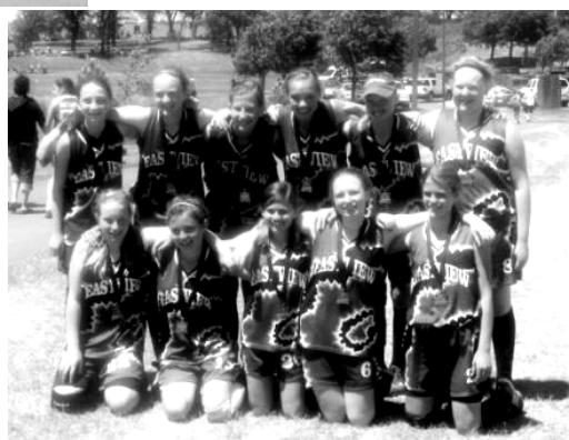
At right: 3rd Place 12U A

Scorecards are posted on the EVAA Traveling Basketball website, www.evaabasketball.org , under Coach and Player Development.