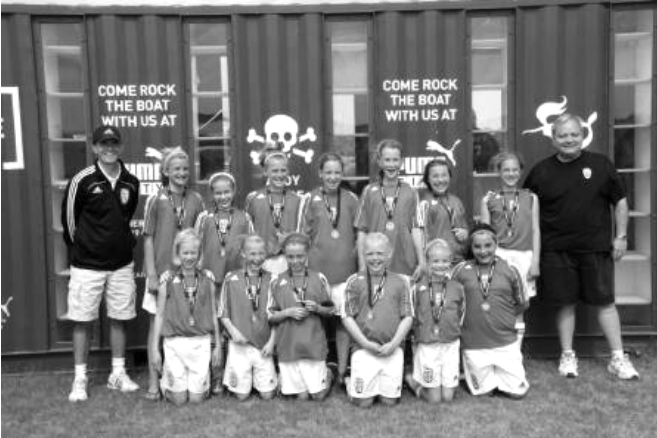
Rev-Tide Champions in St. Croix