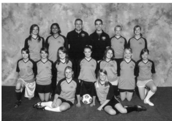
Teams model the new soccer uniforms. Don't they look sharp?!