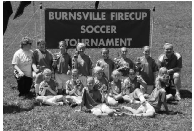
Rev-Tide Runners' Up in Burnsville

The Rev-Tide were tournament Champions in St Croix and Runners' Up in Burnsville.