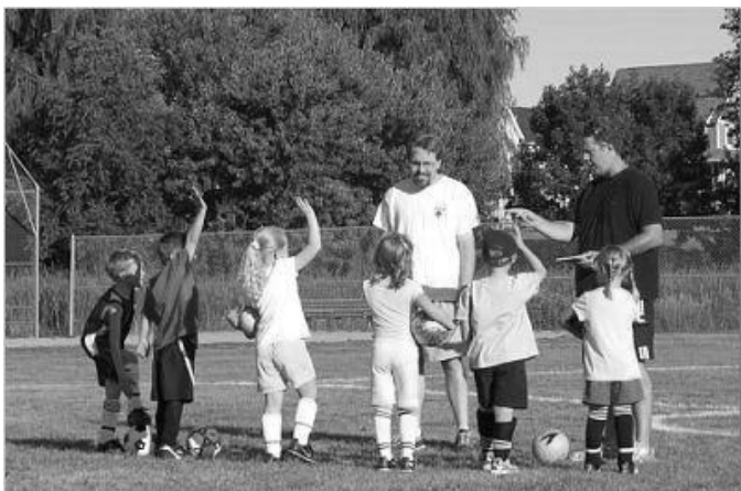
Kindergartners have fun playing soccer