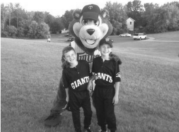
Having fun with TC during the Twins Night ticket pick up event. Look at those smiles!

Many of you have spent the summer at the Johnny Cake Ridge fields watching multiple sporting events; baseball, soccer, softball games. If you have been in the vicinity of fields 6 and 7, you may have noticed the addition of two batting cages just north of the fields. These new cages will serve participants of EVAA Baseball and Softball programs, and Eastview High School Baseball and Softball programs. In addition, the facility will be available to participants of all EVAA and VAA hosted MBT Qualifier, State Tournaments, and August Classic Tournaments.