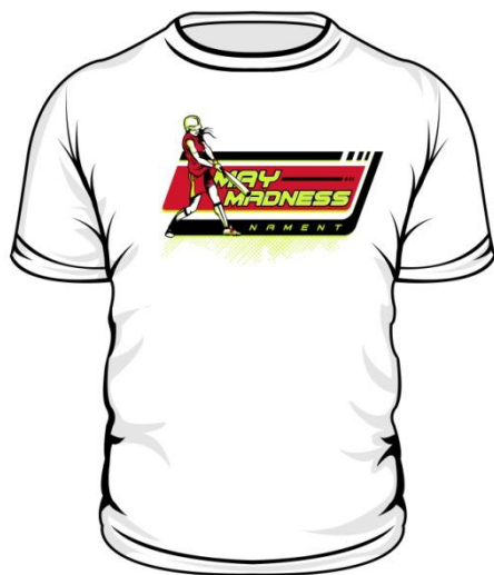
A / B