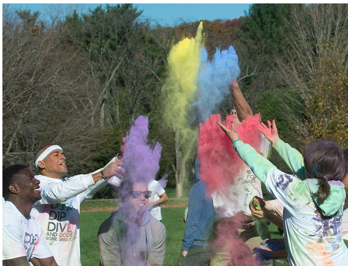
A COLOR DODGEBALL tournament Oct. 27 at Purdue's Horticulture Park helped to raise money for the NFF Scholarship Fund and Dream Season. The event was sponsored by Purdue Gold Standard, a student organization.