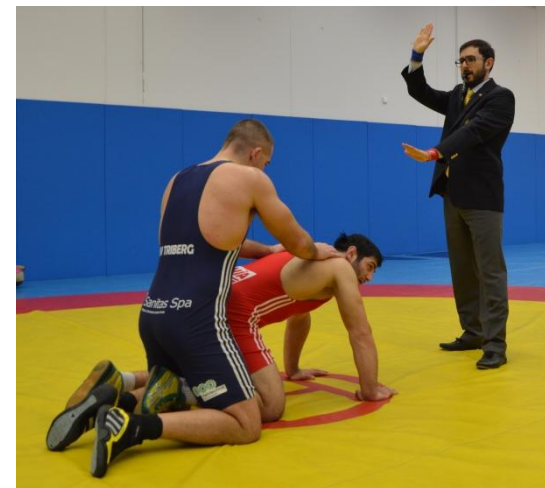
2 knees down