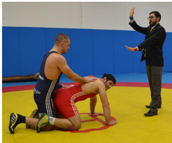
1 knee down