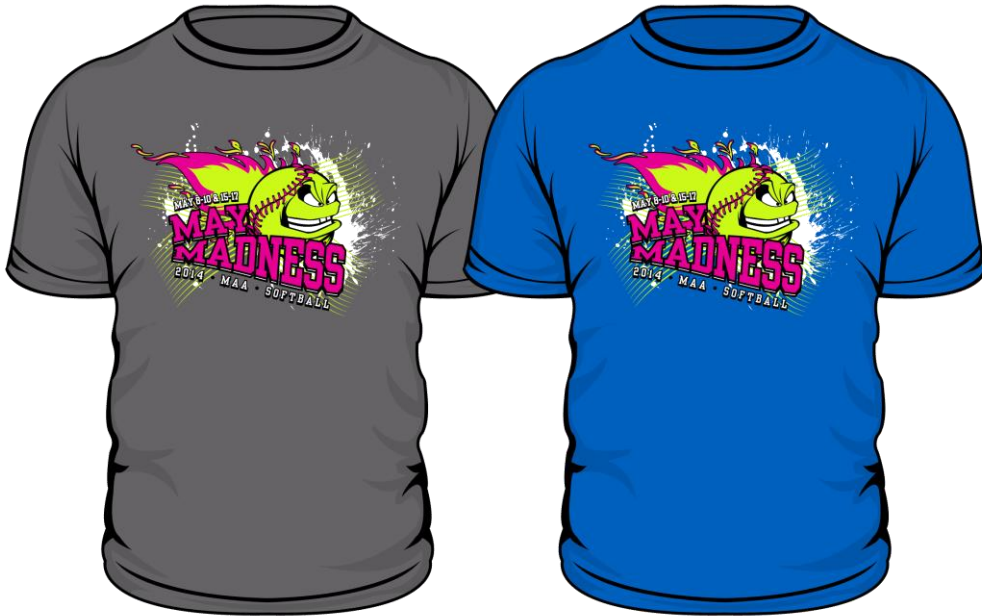
A / B / C / D