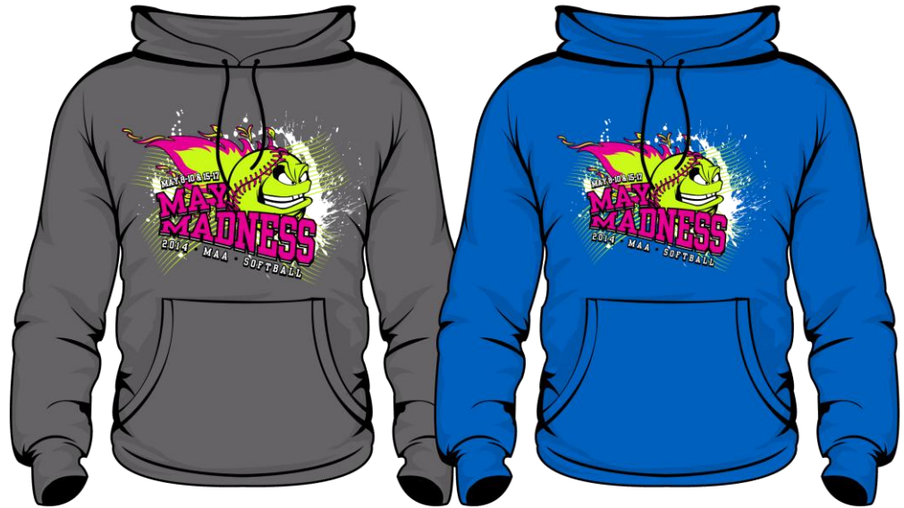
E / F