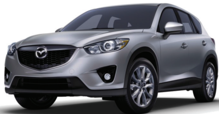
2015 MAZDA CX-5