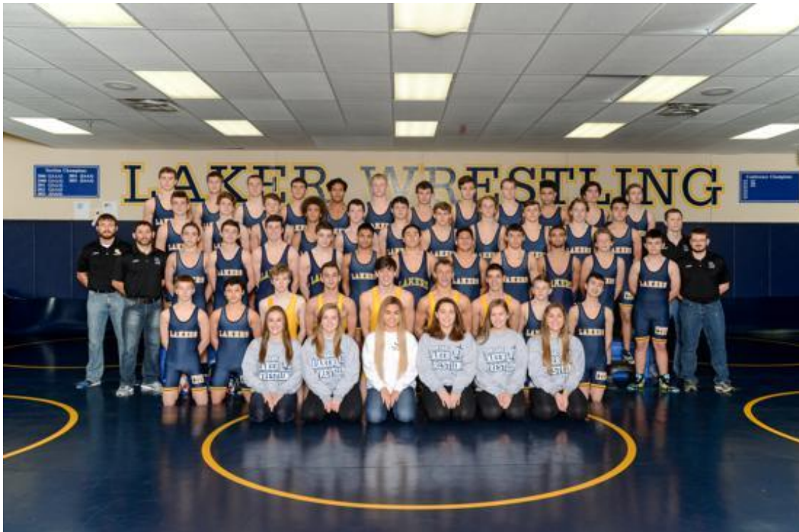
High School Wrestling Team