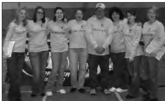
Premier Bankcard Spearfish