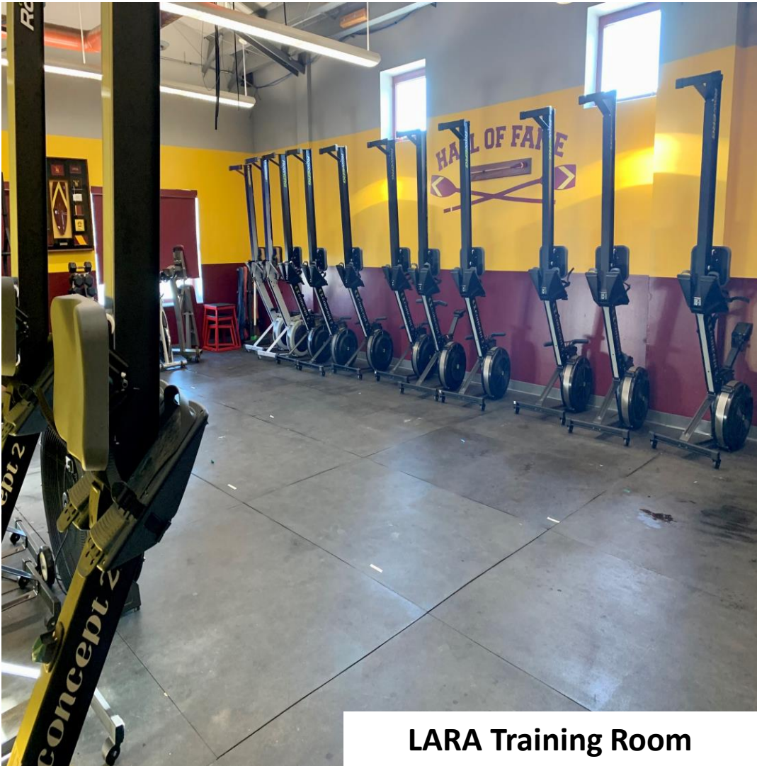
LARA Training Room