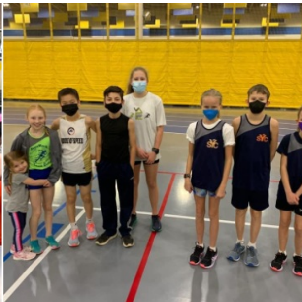
A handful of our SYC Track & Field athletes recently competed at the TJ Community Center All-Comers meet, many of whom came away with top-three performances! Go