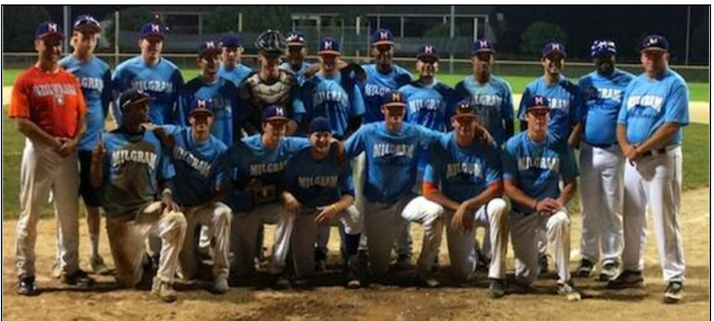
CHAMPIONS - Milgram Mustangs won the fifth and deciding game in the tournament finals against Seaboard to capture the league championship July 31 at Mid-America Sports Complex. The Mustangs beat Seaboard, 12-4, in the title game.