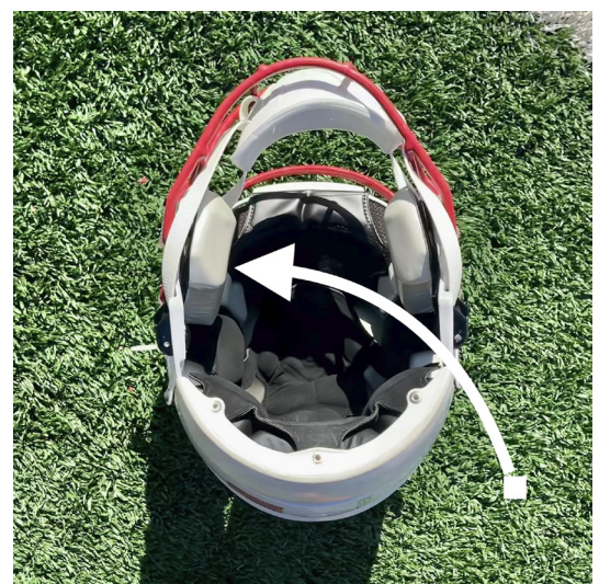
Figure 1 Football helmet with increased padding around the zygoma/mandible indicated by arrow.

To that end, progress has been made in reducing the risk of SRCs in high school football. When policies aimed at limiting contact in football practices were implemented, practice-related SRC rates were reduced by 64%. 10 Coach participation in a comprehensive football safety standards training programme also reduced the rate of SRCs in practices and games by 50%. 11 Modifications of helmets to increase padding over the zygoma/mandible were associated with a 31% lower rate of SRC (figure 1). 12 Interest in further improving the effectiveness of football helmets has continued.