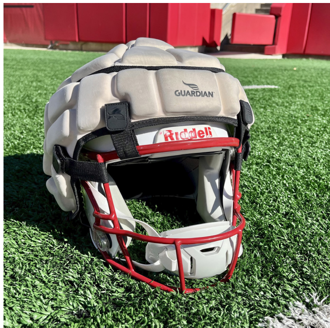
Figure 2 Football Guardian Caps NTX installed on a football helmet.

Aftermarket add-on shell devices for football helmets, such as the Guardian Cap (GC), have been developed to reduce head impact forces (figure 2). The use of these devices was mandated during the preseason in certain position groups by the NFL in 2022 on the premise of reducing the cumulative impact forces to the head. 13 Subsequently, the NFL attributed a significant reduction in concussion rates during the preseason to GCs. 14 Laboratory studies investigating the efficacy of GCs to reduce impact forces have had mixed results, and no studies have investigated the real-world effectiveness of GCs to prevent SRC in high school football players. 15–17 The objective of this study was to determine if GC use during practice was associated with a lower risk of SRC during practices or games among high school football players.