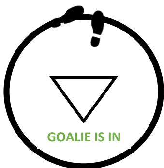
Goalie has both feet (anywhere) on the GC line