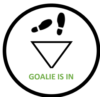
Goalie has both feet in the circle

Rule Update: The goalkeeper, while within the goal circle: d. may reach out her crosse and bring the ball back into the goal circle provided one foot is inside the goal circle. Note: "Inside" includes foot touching the goal line. Rule Reference: 7.2.1. Situation A