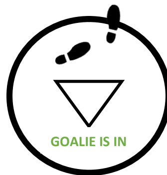
Goalie has one foot in the circle and one foot (anywhere) on the GC line