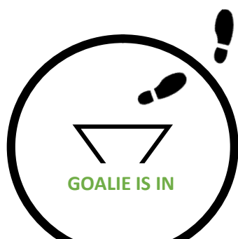
Goalie has one foot in the circle and one foot outside the circle