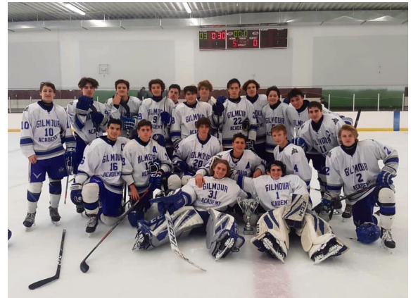
Gilmour Academy captured the championship at the Cornfield Cup in Culver, IN last weekend.

The Padua Tournament brings together 12 of the top high school hockey programs in the state. Five GLHL teams—Holy Name, St. Edward, Shaker Heights, University School and host Padua Franciscan—are joined by four top programs from the Toledo area (Findlay, Sylvania Northview, Toledo St. Francis and Toledo St. John’s) and three from Columbus (Olentangy Liberty, St. Charles and Upper Arlington).