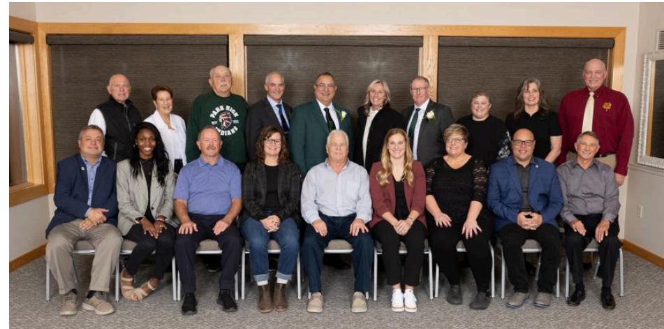
2024 and Past Inductees