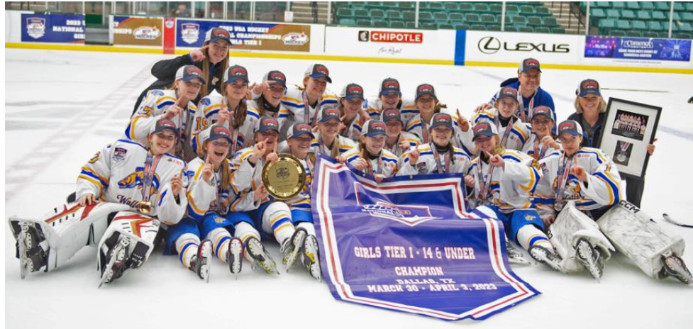
2023 U14 Tier 1 Girls USA Hockey National Champions