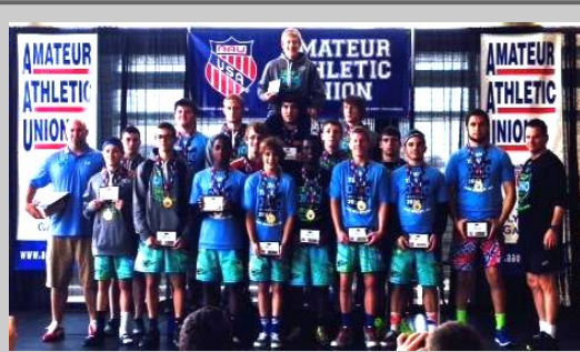
TEAM OHIO SCARLET 2014 National Champions