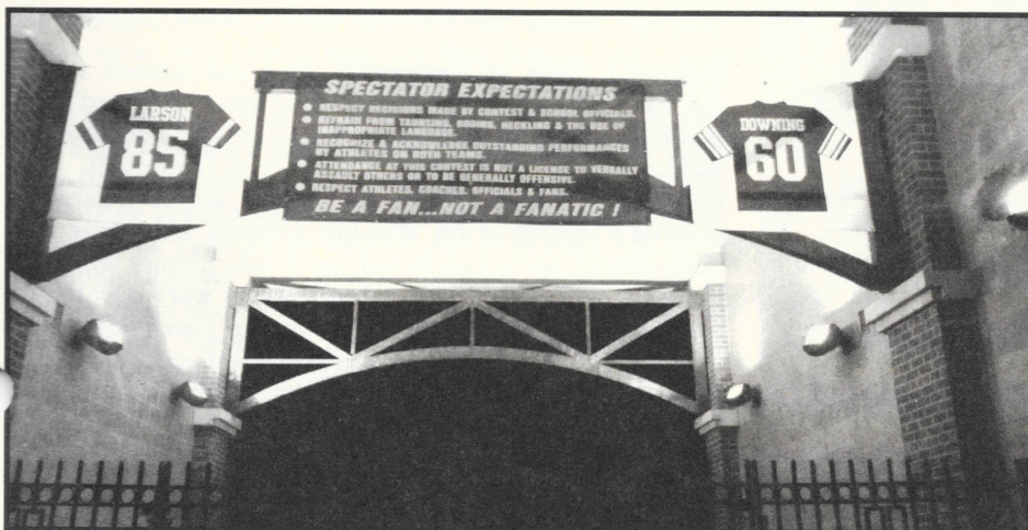
The retirement of the football jerseys of two Roosevelt greats was celebrated at Homecoming and reported in the last newsletter.