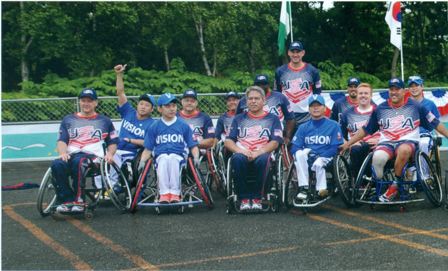
Team USA and Team Japan players bonded during the first International Wheelchair Softball Championship in Japan.

Following year, a team from Japan competed in National Wheelchair Softball Association's (NWSA) annual championship tournament in Chicago. Team Japan recently competed in its fifth consecutive U.S. championship tournament, finishing in fifth place.