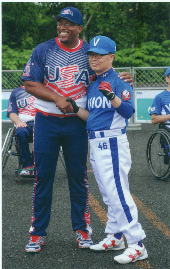
Team USA's and Team Japan's wheelchair softball teams show support for one another.

Japan capitalized on early mistakes by Team USA to take an early lead, but the U.S. battled back to tie the score at two in the fifth inning.