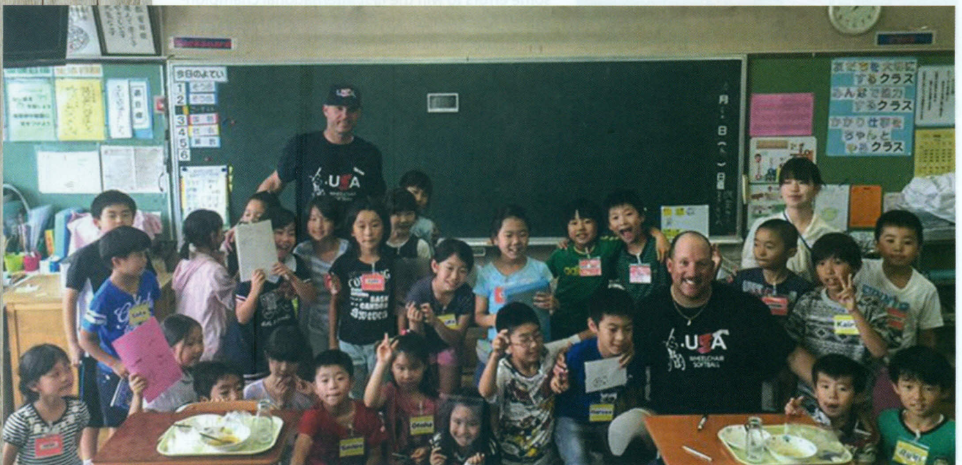
Team USA's wheelchair softball team visited Narihira, an elementary school in Tokyo.