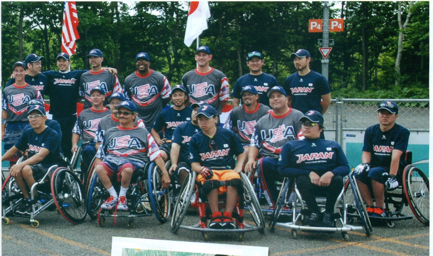
Above, Team USA and Team Japan played in the first International Wheelchair Softball Championship.

ture of our hosts and the Japanese people. This event was amazing and an experience I will never forget."