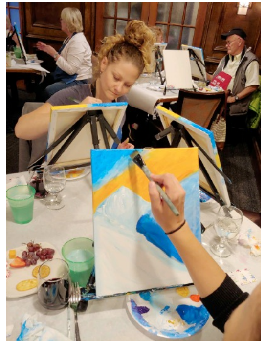
The creative process.