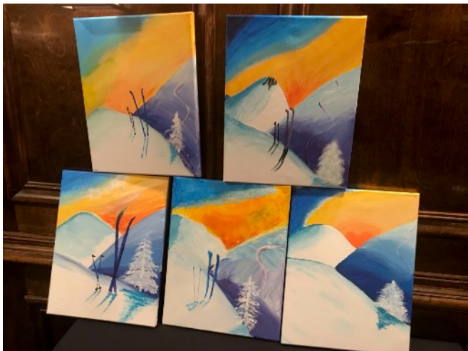
Variations on the same theme.