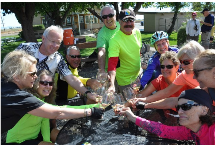
Making a toast at Houston Vineyards.