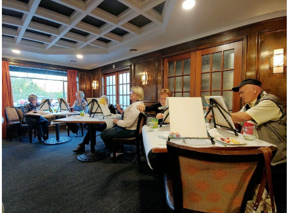
The Plantation Country Club was a perfect venue for this event.