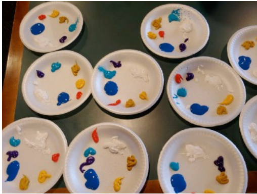
Acrylic paint was the medium of choice.