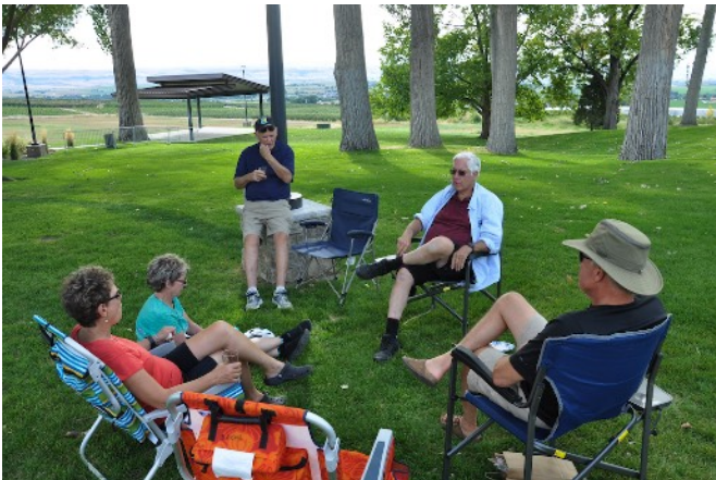
Back at Ste. Chapelle for a pot luck lunch.