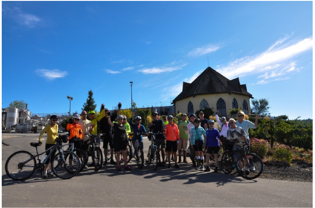
Starting our ride at Ste. Chapelle Winery.

From Sawtooth Winery we returned the short distance to Ste. Chapelle Winery for a pot luck picnic lunch on the shaded grass.