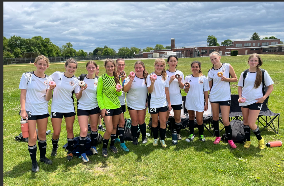
U16 Magic Stars LI Cup Finalists