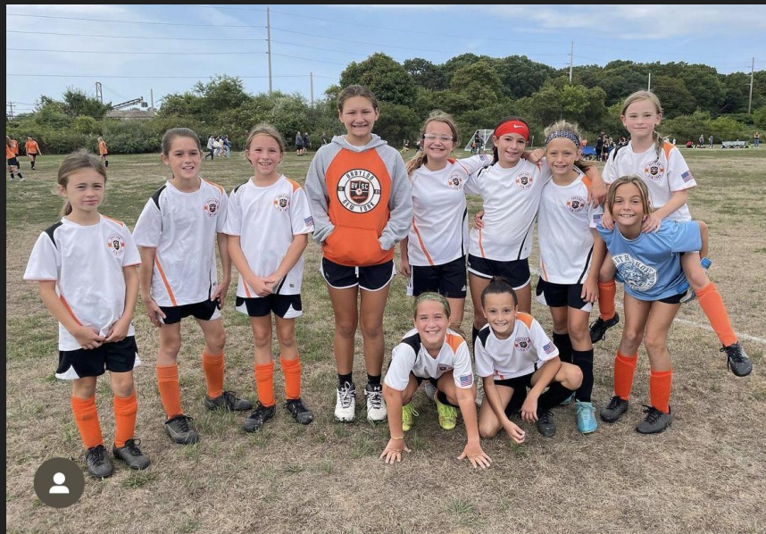
U12 Breakers LI Cup Finalists