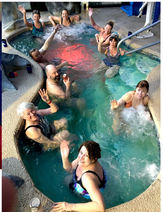
Soothing hot tub to calm those ski muscles.