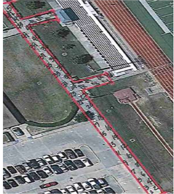
Section 2 – Entrance to Football Fields