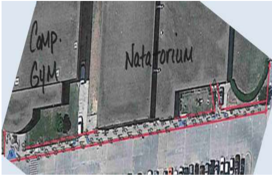
Section 1 – Front of Gym / Natatorium