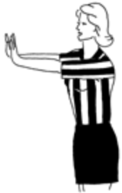
Pushing or Body Contact