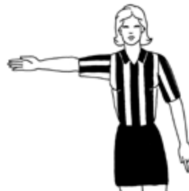
Goal Circle Foul