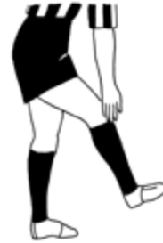
Illegal Ball Off Body