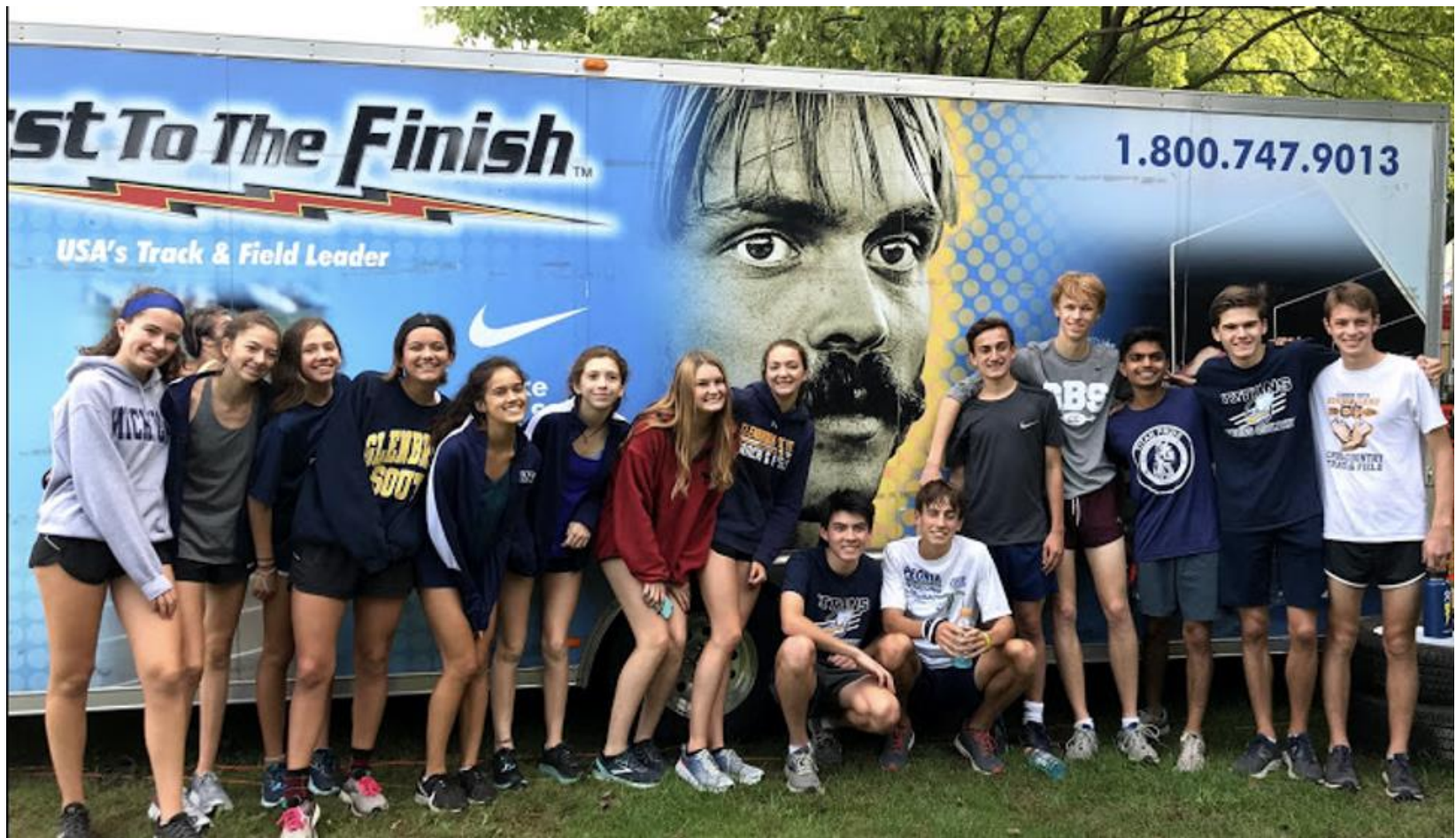
Girls Cross Country