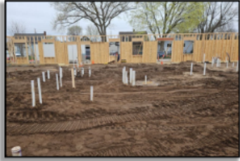
Electrical & Plumbing Underground