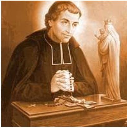
Saint Louis de Montfort