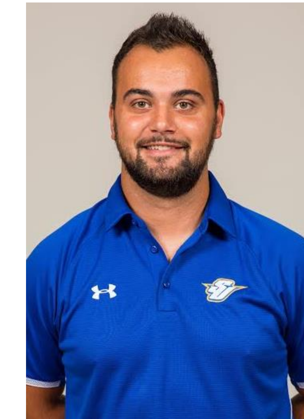
Spalding Univ. Head Coach

Join our staff of collegiate-level, licensed Coaches and Counselors for our annual Summer Skills Camp at CCSA's soccer complex!