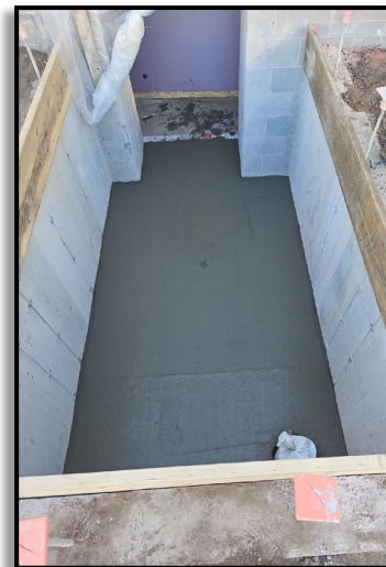
Lower Closet 108 Floors