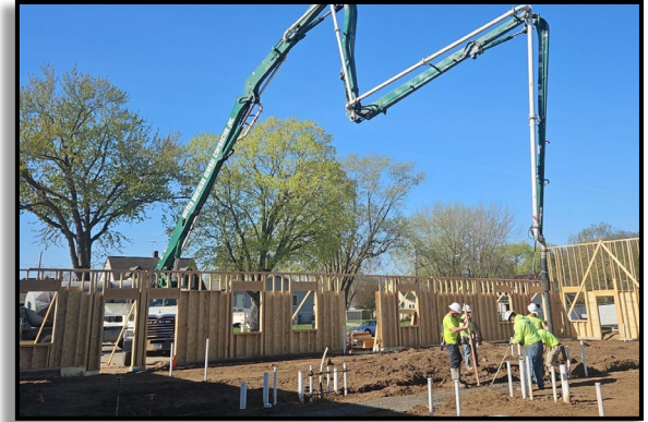
Pouring Interior Concrete Footings