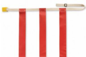
Red Flags SKU# 1149487