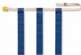
Blue Flags SKU# 1149562