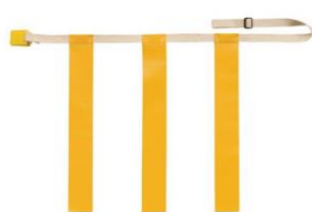
Yellow Flags SKU# 1149524