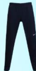
ACADEMY KNIT PANT A1007268 - $34.65