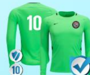
NIKE PARK III GK JER- SEY A1008056 - $45.50