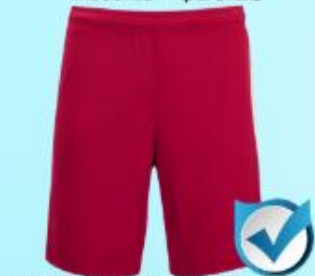
NIKE WOVEN VENOM SHORT A1007135 - $26.95