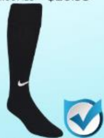
NIKE CLASSIC III SOCK A394386 - $9.24