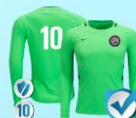
NIKE PARK III GK JERSEY A1008056 - $45.50