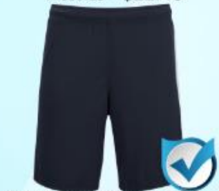
NIKE WOVEN VENOM SHORT A1007135 - $26.95