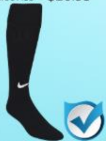
NIKE CLASSIC III SOCK A394386 - $9.24