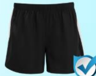
NIKE WOVEN VENOM SHORT A1007135 - $26.95