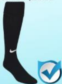
NIKE CLASSIC III SOCK A394386 - $9.24