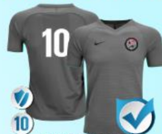
NIKE TIEMPO PREMIER JERSEY A1006729 - $23.94