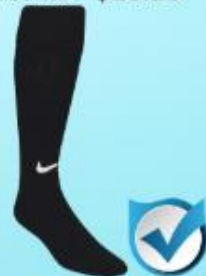
NIKE CLASSIC III SOCK A394386 - $9.24