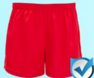
NIKE WOVEN VENOM SHORT A1007135 - $26.95