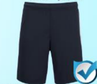
NIKE WOVEN VENOM SHORT A1007135 - $26.95