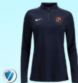
ACADEMY DRILL TOP A1007262 - $46.50