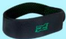
UNEQUAL HALO 3 7MM HEAD GEAR A1005245 - $37.73