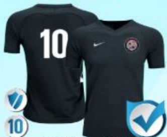
NIKE TIEMPO PREMIER JERSEY A1006729 - $22.40