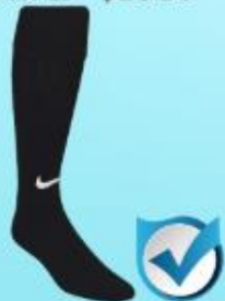
NIKE CLASSIC III SOCK A394386 - $9.24