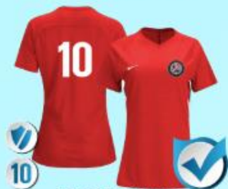
NIKE TIEMPO PREMIER JERSEY A1006729 - $26.25