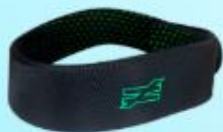
UNEQUAL HALO 3 10MM HEAD GEAR A1005243 - $37.73