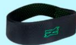
UNEQUAL HALO 3 6MM HEAD GEAR A1005244 - $37.73