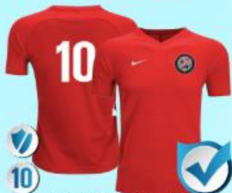
NIKE TIEMPO PREMIER JERSEY A1006729 - $26.25