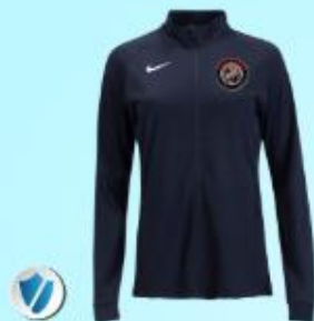
ACADEMY TRACK JACKET A1007260 - $50.35