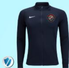
ACADEMY TRACK JACKET A1007236 - $50.35