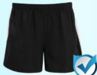
NIKE WOVEN VENOM SHORT A1007135 - $26.95