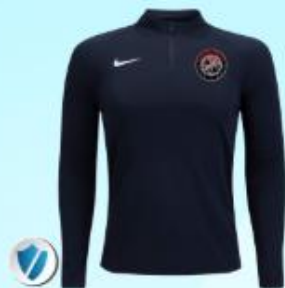
ACADEMY DRILL TOP A1007238 - $46.50