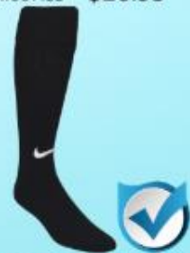
NIKE CLASSIC III SOCK A394386 - $9.24