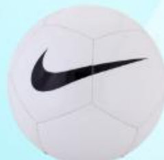
NIKE PITCH TEAM BALL A96411 - $15.40