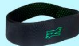
UNEQUAL HALO 3 6MM HEAD GEAR A1005244 - $37.73