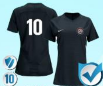
NIKE TIEMPO PREMIER JERSEY A1006729 - $22.40