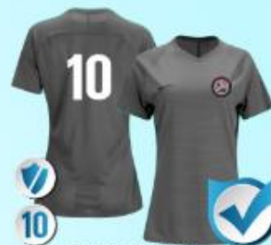
NIKE TIEMPO PREMIER JERSEY A1006729 - $23.94