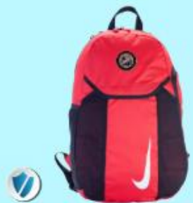
NIKE ACADEMY BACKPACK A1008436 - $46.50