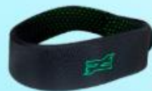
UNEQUAL HALO 3 10MM HEAD GEAR A1005243 - $37.73