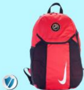
NIKE ACADEMY BACKPACK A1008436 - $46.50