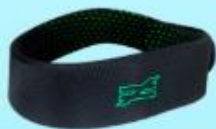
UNEQUAL HALO 3 7MM HEAD GEAR A1005245 - $37.73