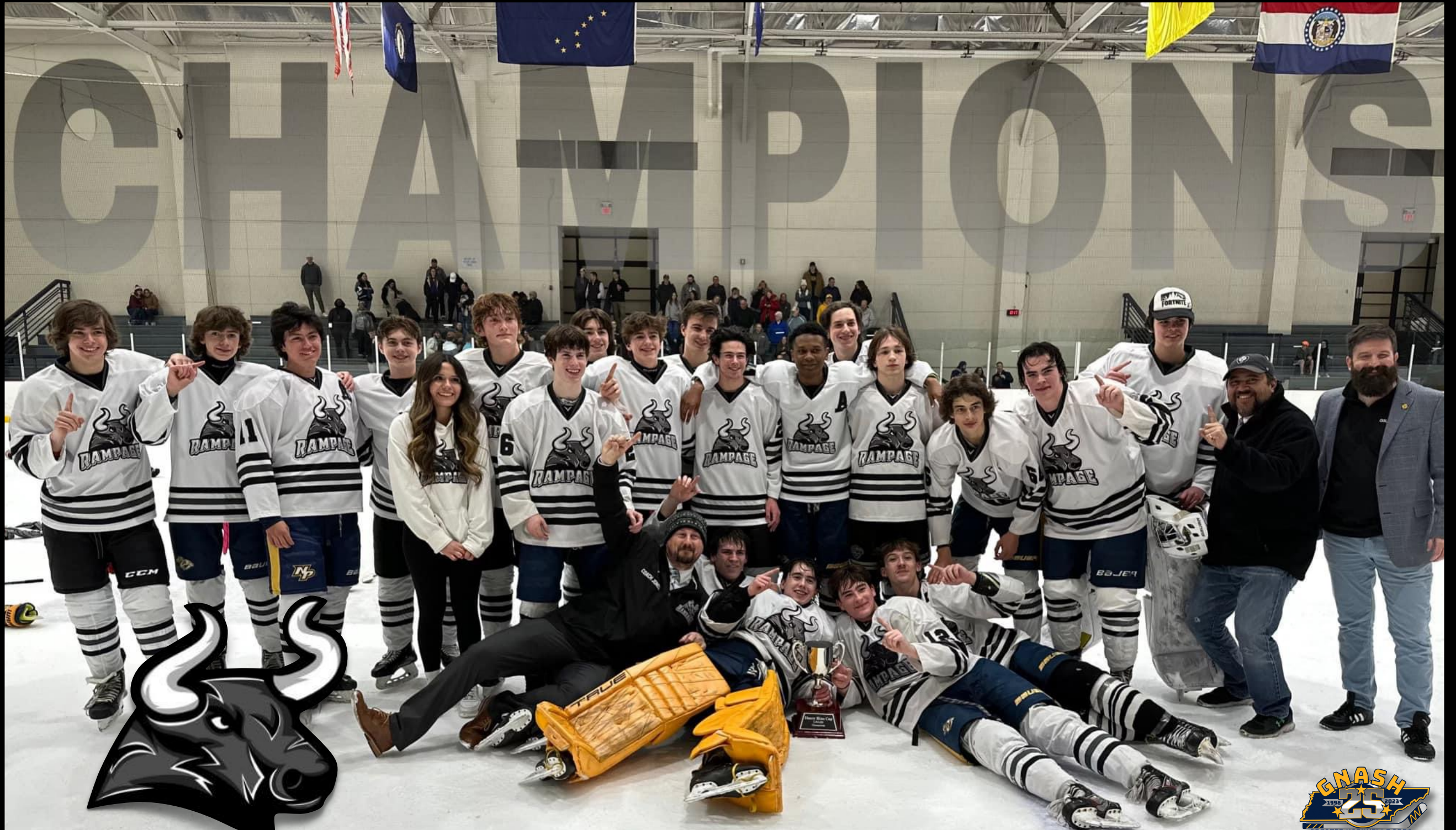
Rutherford Rampage 2023-24 Henry Hine Cup Champions