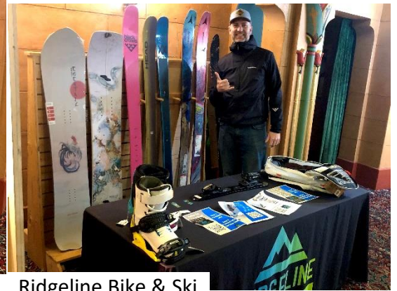
Ridgeline Bike & Ski