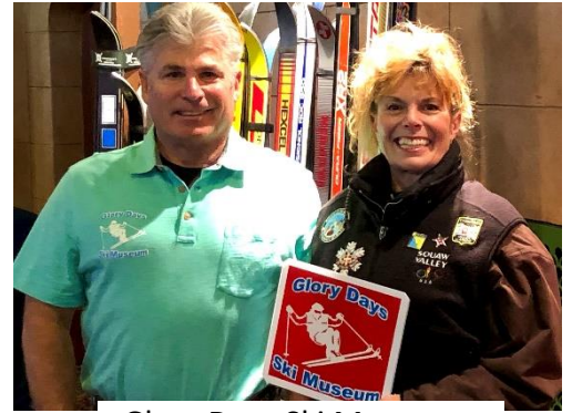
Glory Days Ski Museum