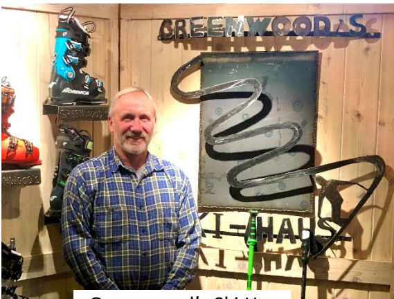
Greenwood's Ski Haus