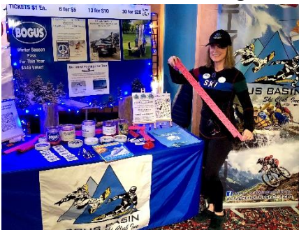
Bogus Basin Ski Club

Another BIG "Thank You" goes out to our local sponsors: