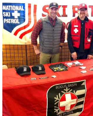
Bogus Basin Ski Patrol