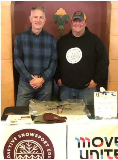
Boise Adaptive Snowsport Education