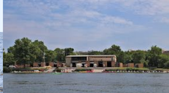
Thompson Boat Center (TBC)