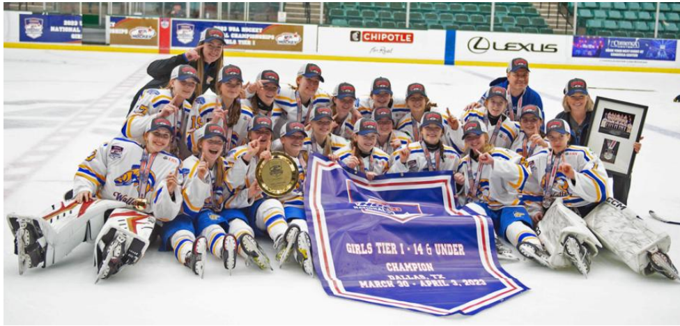
2023 U14 Tier 1 Girls USA Hockey National Champions