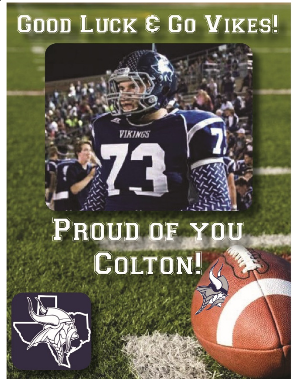
Example of 1/4 Page Good Luck Ad ** Not to scale