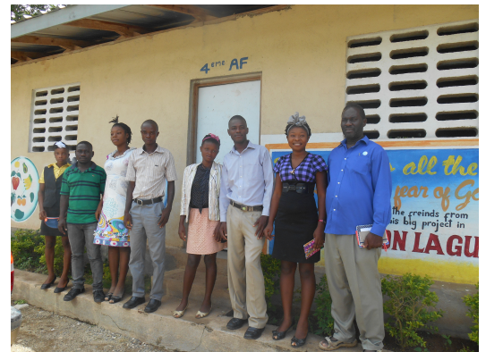
The teachers @ Laguille!!