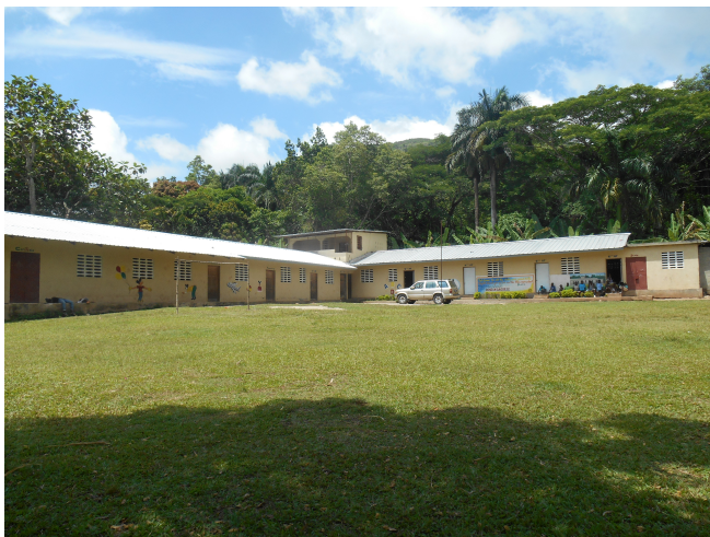
The school in the beautiful mountains of northern Haiti

We need your help to continue the growth at our school in Laguille, Haiti. Our students have come so far in such a short amount of time. Please consider making a donation to our students.