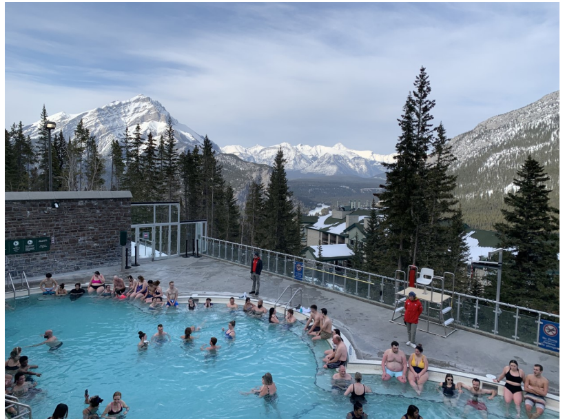
Banff Upper Hot Springs

greeted with fresh snow Monday and Tuesday and then full sun Wednesday thru Friday. Ski conditions were wonderful. The Caribou hot tub was huge and large enough for all to congregate after a great day on the slopes to share stories. Skiers had their choice of many great restaurants for dinner in Banff, and some found time to go shopping.