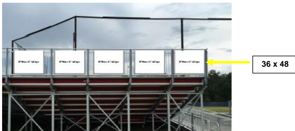
2018 Gold Level Sponsors (1 st Base Dugout Side)

One (1) Premier Sponsor* Directly Next To Championship Years @ $1500.00