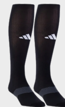
TRAINING /HOME SOCK