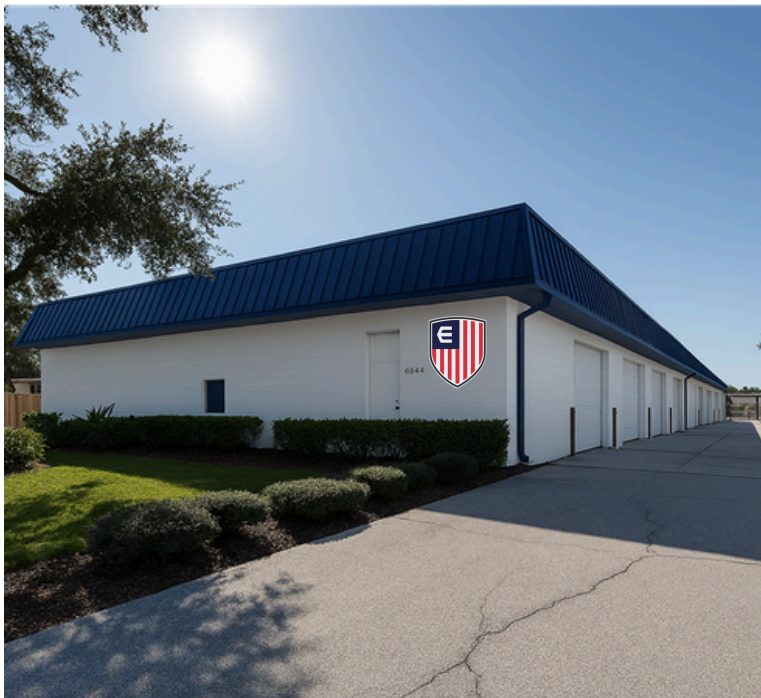
Exterior Facility View

This space is more than a building. It is a long-term investment in stability, opportunity, and excellence—ensuring Elite Volleyball can continue expanding access to high-quality training while supporting the next generation of athletes and leaders.