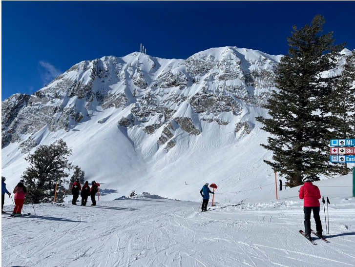
Bluebird day at Snowbasin

I'm sure that there were some groomed runs buried underneath the deep powder on the first day of skiing but we certainly could not find them. We soon learned that skiing slightly off-trail resulted in your skis sinking two-three feet down into a mass of moist powder that might not be so easy to ski out of. Despite the challenges, some of us