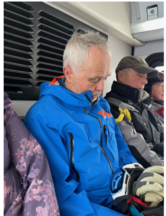
The end-of-the-day bus nap

One thing that is for sure, when we gather for dinner, it is a good time. We really enjoyed each other's company and the restaurants accommodated our boisterous group in a manner where we did not disturb the other diners. Our