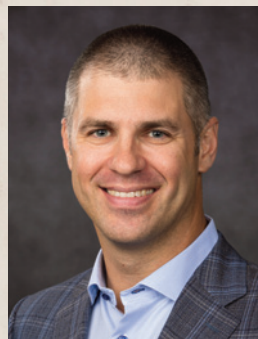
Joe Mauer ATHLETE Cretin-Derham Hall