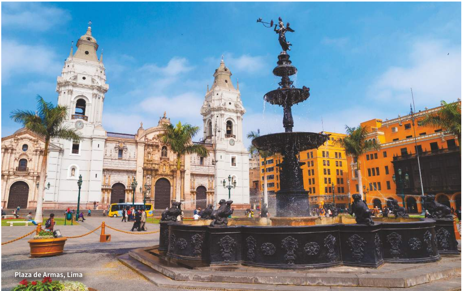
Plaza de Armas, Lima