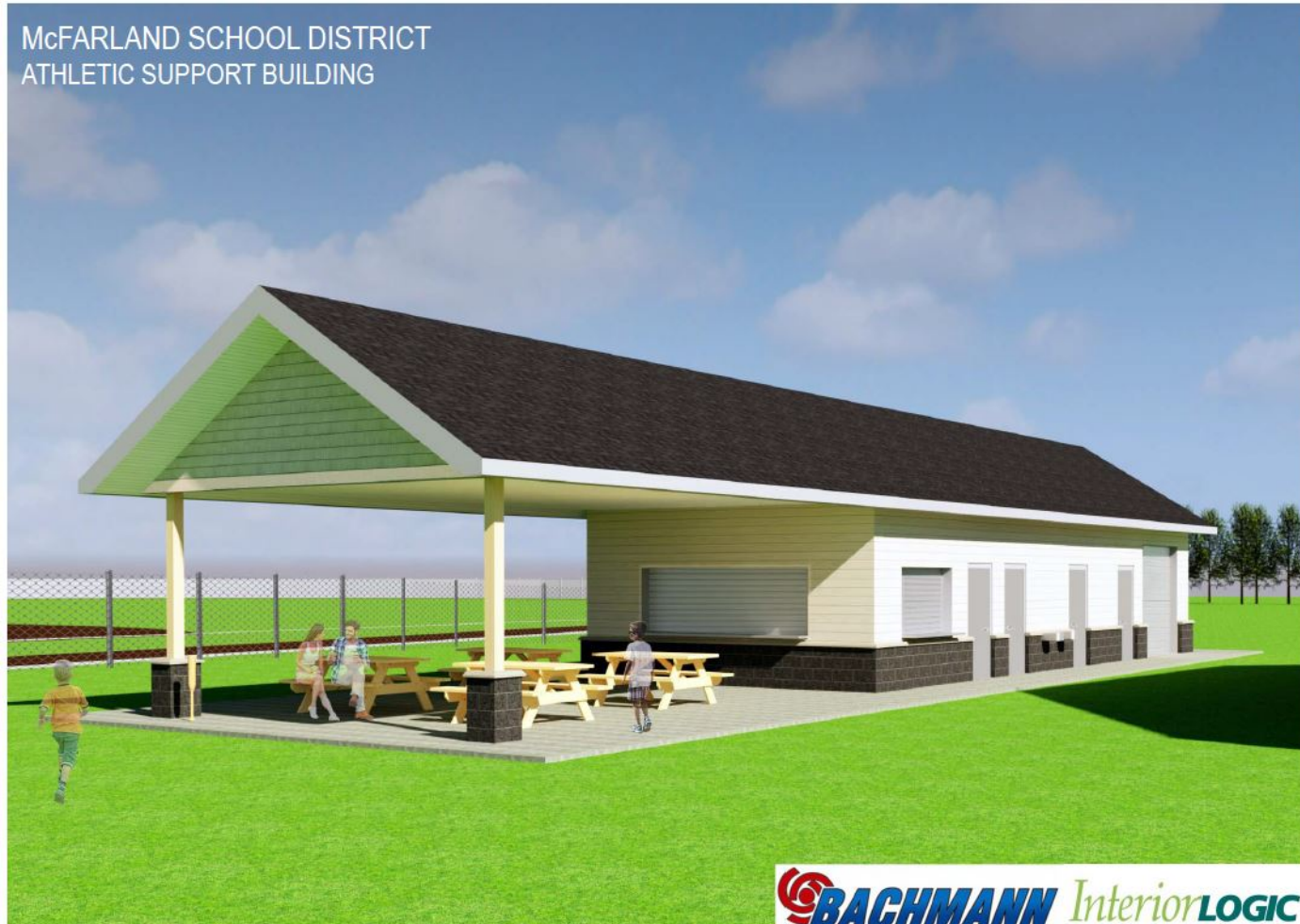
McFARLAND SCHOOL DISTRICT ATHLETIC SUPPORT BUILDING

BACHMANN Interior LOGIC CONSTRUCTION workplace strategy